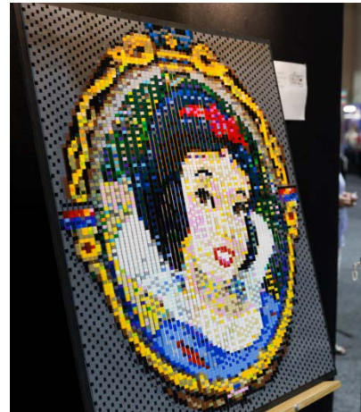
Champion of Champions